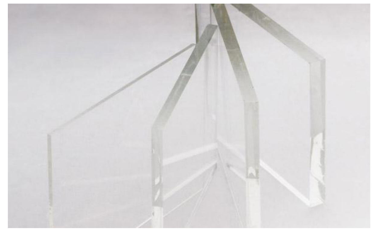
Machining instructions of Toughened ultra white glass:

Ultra white glass is a high-quality, multi-functional new high-grade glass varieties, high transmittance, with crystal clear, high-grade elegant features, the glass family "crystal Prince" said. Ultra white glass also has all the machinable properties of high quality float glass. It has superior physical, mechanical and optical properties, and can be processed like other high quality float glass, such as hot bending and screen printing.